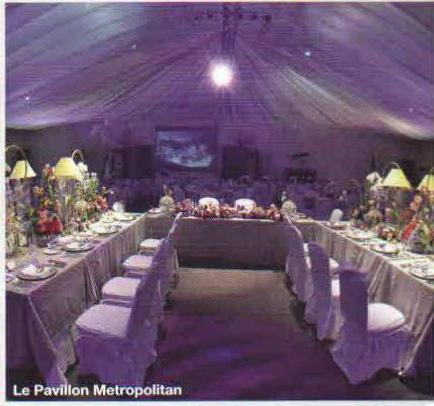
Le Pavillon Metropolitan