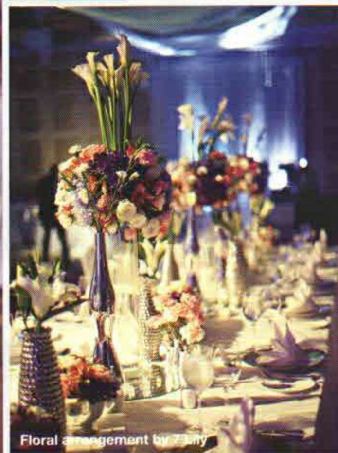
Floral arrangement by 7 Lily