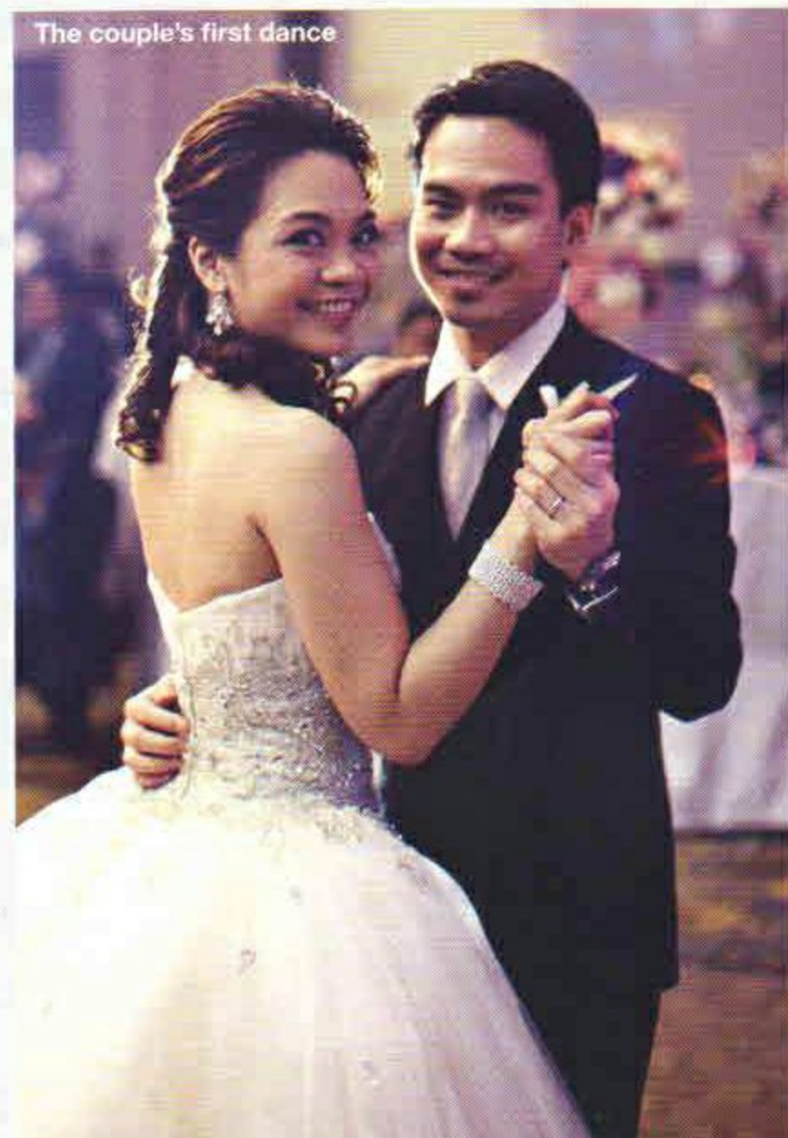
The couple's first dance